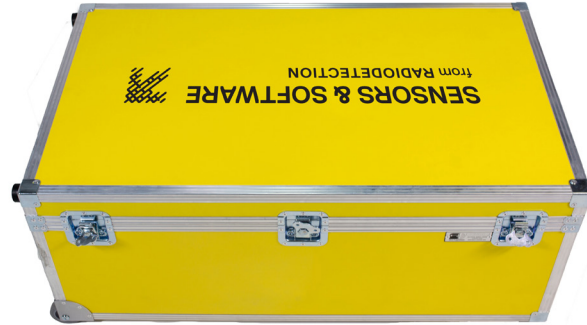
100-60-0058 LMX® Series ATA Shipping Case (includes 100-60-0059 DVL Bag)