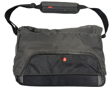
100-60-0059 Soft-sided Display Unit & GPR Accessories Carry Bag