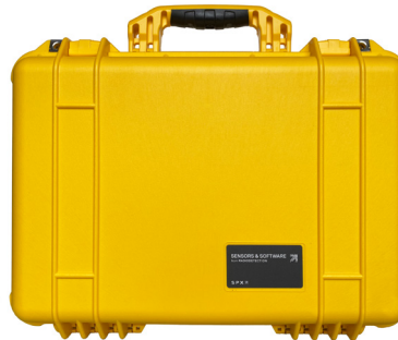
100-60-0066 Deluxe Display Unit Carrying Case