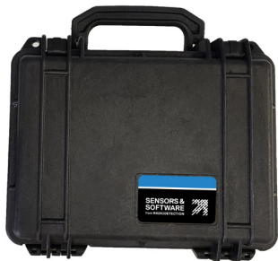
100-55-0023 Spare Battery