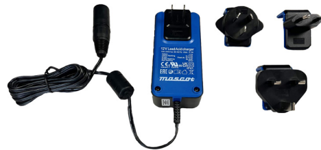
100-55-0028 Spare Battery Charger